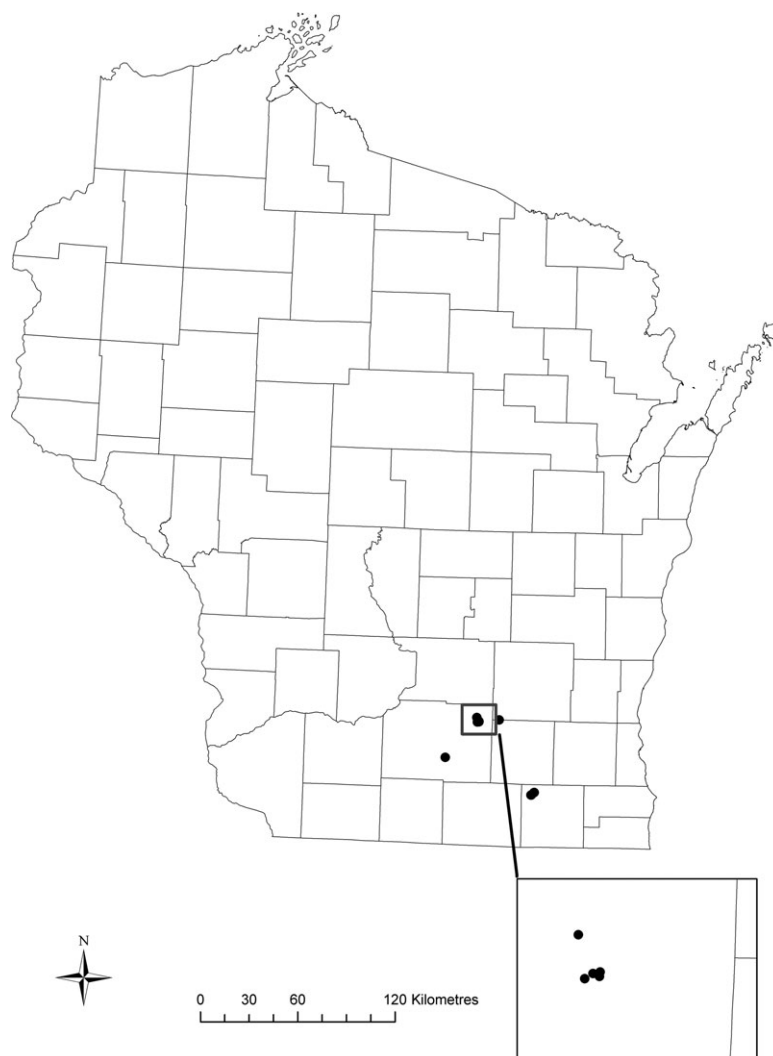
Fig. 1. Study site locations in Wisconsin. Site names have been withheld from this figure due to their ecological sensitivity.

The study was conducted in 11 southern Wisconsin (WI) fen mounds (Fig. 1), including Wings over Wisconsin (WoW) A, B, D, and E (Medina), Cleman's Tract (Township of Oregon), Waterloo (Waterloo), Clover Valley A, B (Whitewater), Bluff Creek A and B (Whitewater) and Deansville Fen (Deansville). WoW B, D, E and Cleman's tract were completely ploughed at least once in the last 100 years. WoW A and Waterloo were both partially ploughed, and contain remnants of unaffected fen